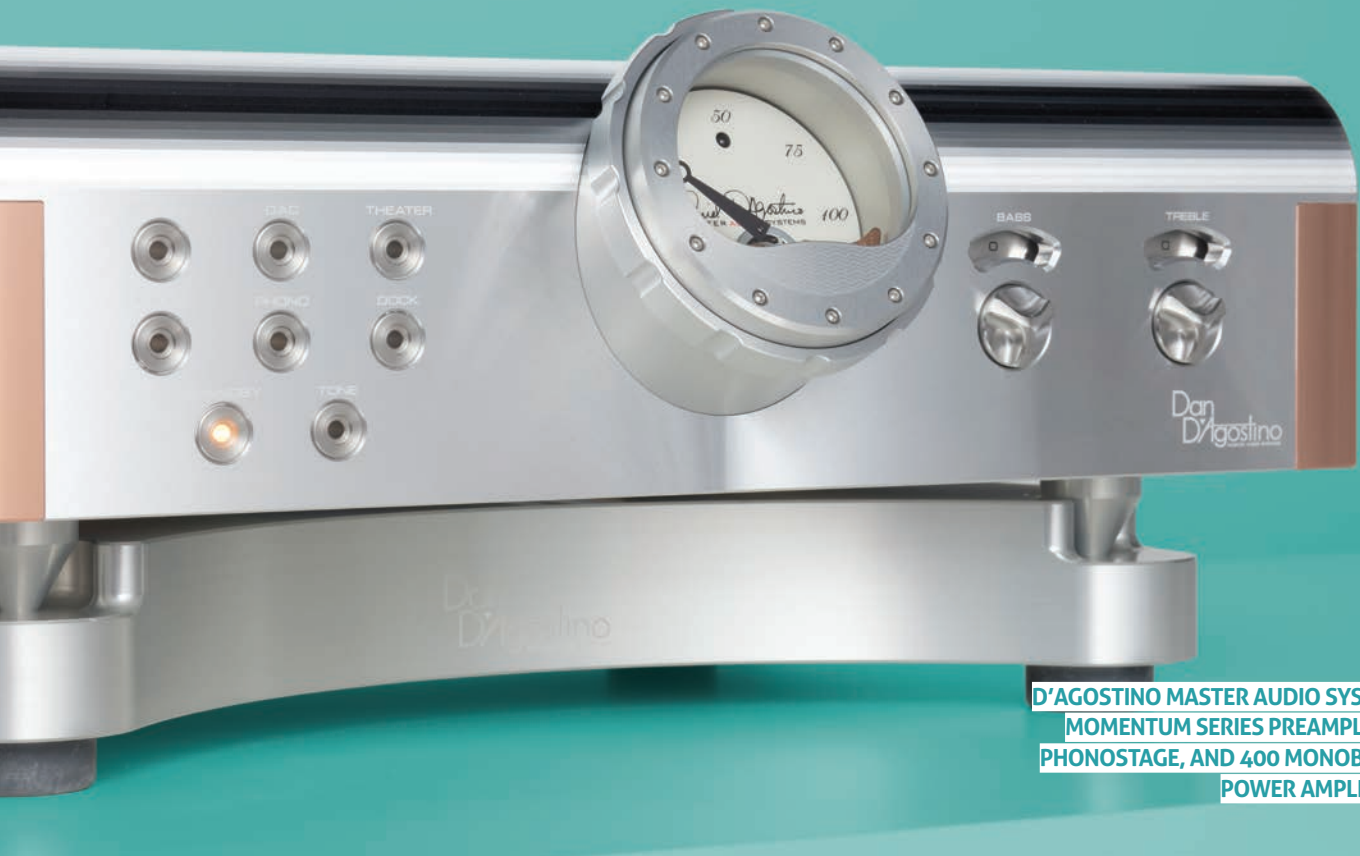
D'AGOSTINO MASTER AUDIO SYSTEMS MOMENTUM SERIES PREAMPLIFIER, PHONOSTAGE, AND 400 MONOBLOCK POWER AMPLIFIERS