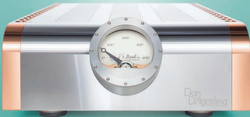
D'AGOSTINO MASTER AUDIO SYSTEMS MOMENTUM SERIES PREAMPLIFIER, PHONOSTAGE, AND 400 MONOBLOCK POWER AMPLIFIERS

phonostage has no fewer than 16 loading options, in addition to equalization curve selections—all available at the touch of a button. Finally, a special feature of the phonostage is that it permits you to add up to 6dB of gain to the standard settings for mc and mm inputs. (I didn't find this necessary given the abundant gain on tap with the preamplifier.)