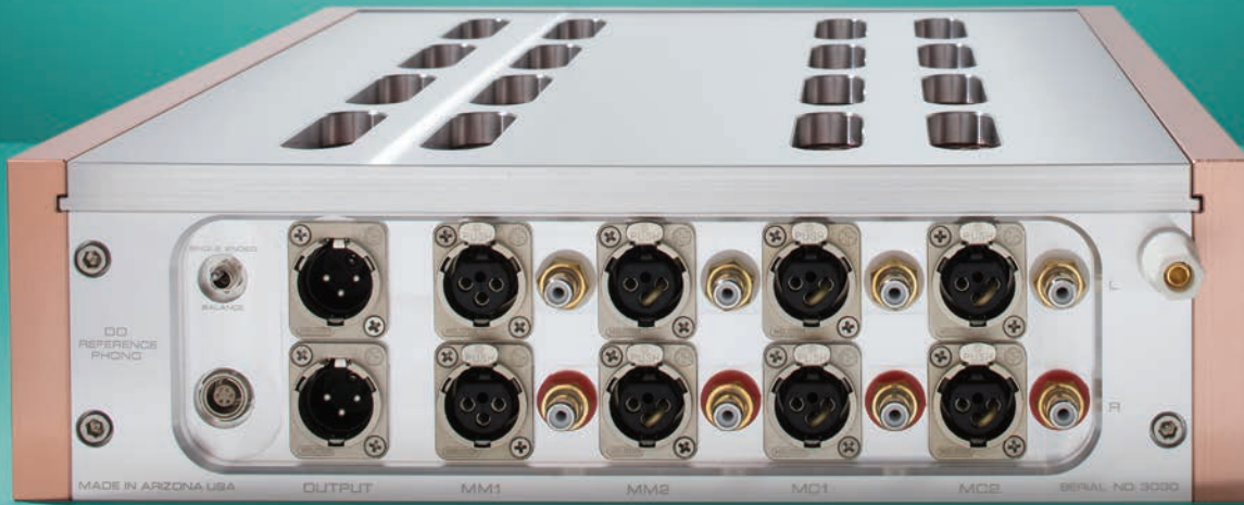
D'AGOSTINO MASTER AUDIO SYSTEMS MOMENTUM SERIES PREAMPLIFIER, PHONOSTAGE, AND 400 MONOBLOCK POWER AMPLIFIERS